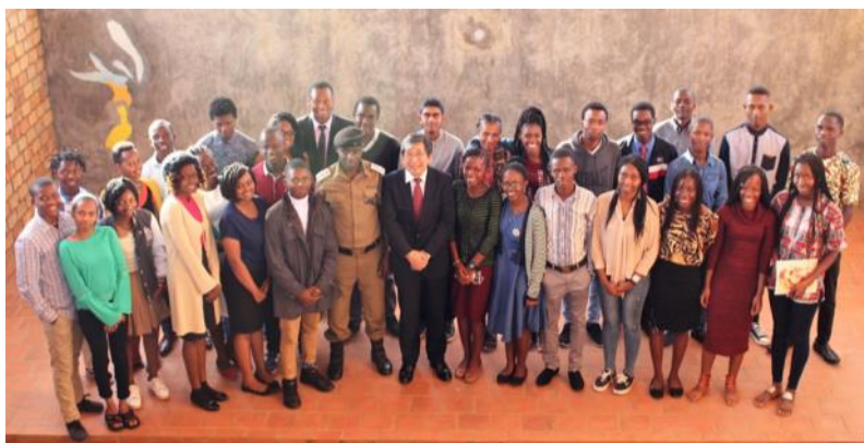
Study Camp 2018 Kokoro-Juku Opening Ceremony

“Ashinaga Uganda is a Japanese International NGO that provides educational and psychosocial support to orphaned students in Sub-Sahara Africa. One of facilities, the Rainbow House (RH) provides material support for more than 800 registered children and primary school scholarships for 45 children who have lost one or both parents in Nansana, Wakiso.