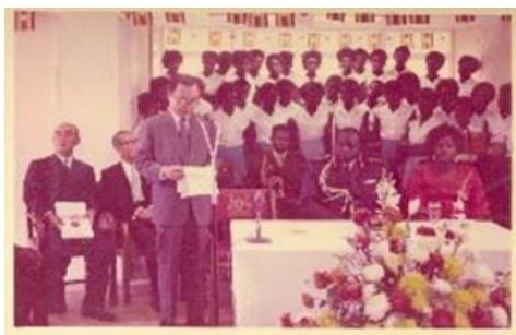
Opening Ceremony of Nakawa VTI in 1971, a start of history of collaboration between Nakawa and Japan

JICA's support to Nakawa Vocational Training Institute (Nakawa VTI) started in 1968, which means Japan has supported BTJET (Business, Technical and Vocational Education and Training) sub-sector for 50 years. Though during a certain period, support was suspended due to internal conflicts in Uganda. The first JICA Technical Cooperation Project titled, "Uganda Vocational Training Center" was implemented from 1968 to 1974 in partnership with Nakawa VTI as the counterpart. This was aimed at supporting skill up-grading trainings demanded for promotion of small and medium enterprises. The Project established the training mechanism in the fields of Machinery & Fitting, Welding and Fabrication, Motor Vehicle mechanics and Electricity departments. During that time Uganda was faced with political instability that followed independence from England in 1962. It was difficult to have a smooth implementation of the project but we believe the trainees nurtured in the said fields are still essential in industries that have served as a foundation for industrial development in Uganda.