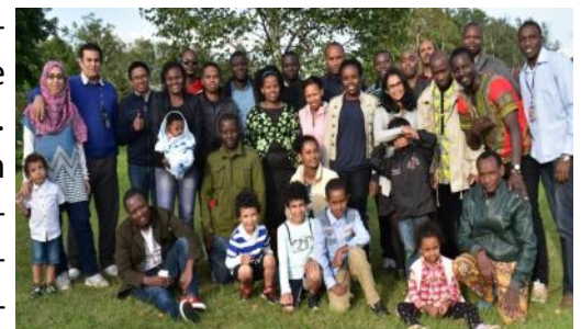
Members of the AORNet in Obihiro, from different countries in Africa

Based on my experiences, I strongly believe that programs such as the ABE initiative, that offer both skills and a practical experience to the youth from Africa play a fundamental role towards the social economic development of the African continent. For, the bridges and foundations we create now will shape the future not just for us but also for the next generations."