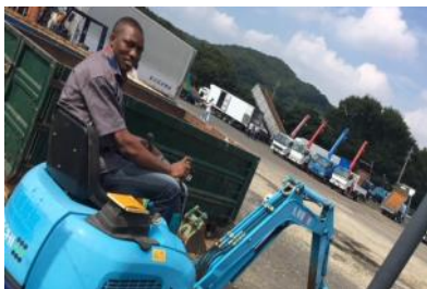
Hands on training; learning how to operate light duty machinery at Nentrys company during internship