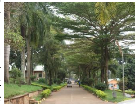
A line-up of Trees representing JICA Experts from the main entrance

After the completion of the first project and JICA's suspension period of its support to Uganda (due to internal conflicts), JICA resumed its support. In 1994, when the GoU officially requested JICA to support industrial human resource development which was the most prioritized concern at that time. The shortage of skilled workforce caused by the prolonged internal conflict slowed down economic development in Uganda. And in 1994 JICA resumed its support with dispatching JICA experts to Nakawa VTI, and since then up to the currently on-going project titled, "TVET-Leading Institution's Expansion of Human Resource and Skilled Workforce Development for Industrial Sector" in Uganda (TVET-LEAD Project); JICA has continuously supported industrial human resource development not only in Uganda but also in surrounding countries through Nakawa VTI.