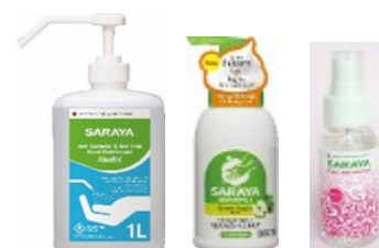
Products from left to right:

WE ARE ALSO PASSIONATE about developing products which meet specific needs in Africa. A pocket-sized “Toilet Seat Sanitizer 60ml” has been launched responding to the voices of women who are conscious about unhygienic conditions of shared toilet seats. This product will be available at almost all major supermarkets in Kampala by the end of this year! ”