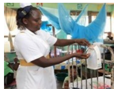
ALSOFT USED IN A HOSPITAL

IN AFRICA, we established our first factory in Uganda which has been operational since 2012. Our focus is on infection prevention through hand disinfectant called “Alsoft V”, which we locally manufacture, meeting the WHO and CDC standards. It has been used at many healthcare facilities in Uganda including governmental hospitals, procured through National Medical Stores (NMS). In 2012 and 2014 when Ebola broke out, we provided our product to Ministry of Health as well.