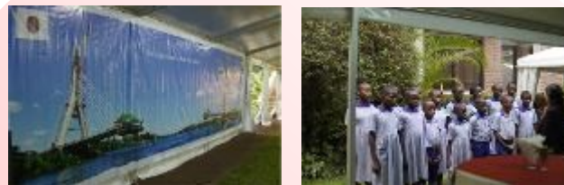
84TH EMPEROR'S BIRTHDAY RECEPTION