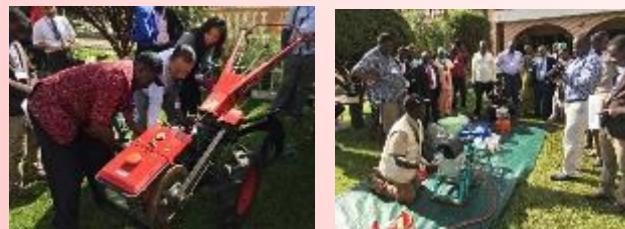
SEMINAR ON FOOD VALUE CHAIN PROMOTION

IN PICTURES: A delegation from Japan presented agricultural machines during a seminar on food value chain hosted by the Japanese Ministry of Agriculture, Forestry and Fisheries in Nov.