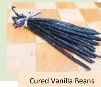
Cured Vanilla Beans

Our vanilla beans are purchased from vanilla farmers in the central Uganda area. And then, they are fermented, dried and aged carefully. Since the processing of vanilla beans is very delicate and laborious, special care must be taken in the occurrence of mold. We carefully process the vanillin, which is the source of flavor of vanilla. In order to maximize its flavor, we pay close attention for the process for 3 months in our factory.