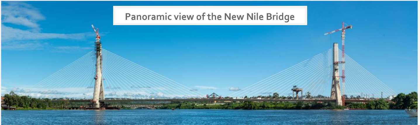
Panoramic view of the New Nile Bridge

Finally, the construction of key structures on the New Nile Bridge; that is, the 2 pylons and the 525m long bridge deck (girder) along with its supporting stay cables, is complete. This was marked by the much anticipated girder centre closure on 27 th April, 2018