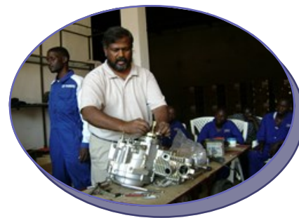
Motorcycle training session

For more information, please contact: Email: nifco@yamahanilefishing.com Tel: +256-41-342722