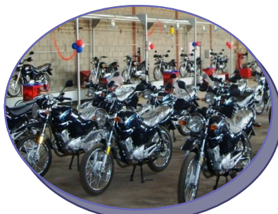
Motorcycle assembly plant in Banda