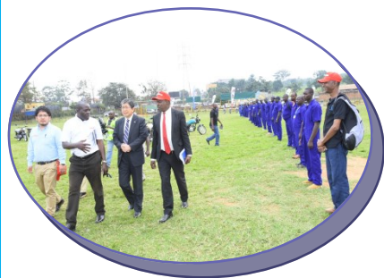
Amb. Kameda at the launch of crux rev

We also provide after sales service, customer education, riders training and training for youth to build a small scale industry.