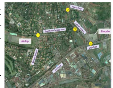
Map showing the 4 junctions under the Pilot Project

As a result, the Experts team together with KCCA designed a pilot project on Area Traffic Control using MODERATO (Management by Origin-Destination Related Adaptation for Traffic Optimisation), where 4 junctions in Lugogo-Kololo areas were signalised.