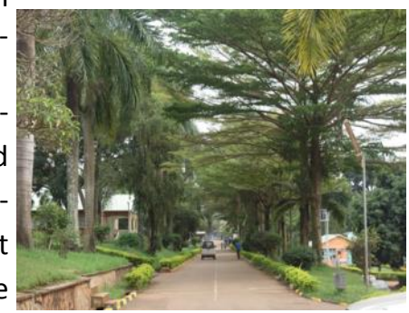
the main entrance

After the completion of the first project and JICA's suspension period of its support to Uganda (due to internal conflicts), JICA resumed its support. In 1994, when the GoU officially requested JICA to support industrial human resource development which was the most prioritized concern at that time. The shortage of skilled workforce caused by the prolonged internal conflict slowed down economic A line-up of Trees representing JICA Experts from development in Uganda. And in 1994 JICA resumed its support