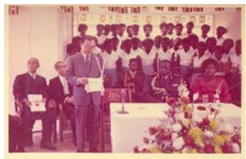
Opening Ceremony of Nakawa VTI in 1971, a start of history of collaboration between Nakawa and Japan

JICA's support to Nakawa Vocational Training Institute (Nakawa VTI) started in 1968, which means Japan has supported BTVET (Business, Technical and Vocational Education and Training) subsector for 50 years. Though during a certain period, support was suspended due to internal conflicts in Uganda. The first JICA Technical Cooperation Project titled, "Uganda Vocational Training Center" was implemented from 1968 to 1974 in partnership with