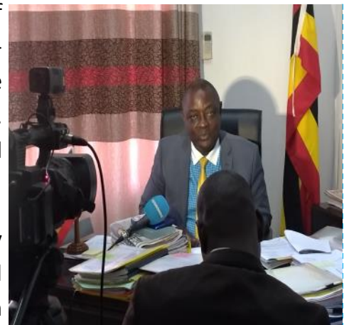
Minister of Agriculture, Animal Industry and Fisheries

There is consensus that JICA's intervention in the rice industry has greatly contributed to the increase in rice production and thus, income and food security amongst target communities in Uganda.