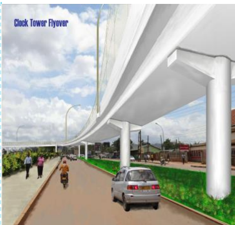
Clock Tower flyover

The project funded by JICA and Government of Uganda, is being constructed by a Joint Venture of Shimizu Corporation and Konoike Construction Co. Ltd and supervised by the Joint Venture of Nippon Koei and Eight-Japan Engineering Consultants in association with ICS on behalf of UNRA.