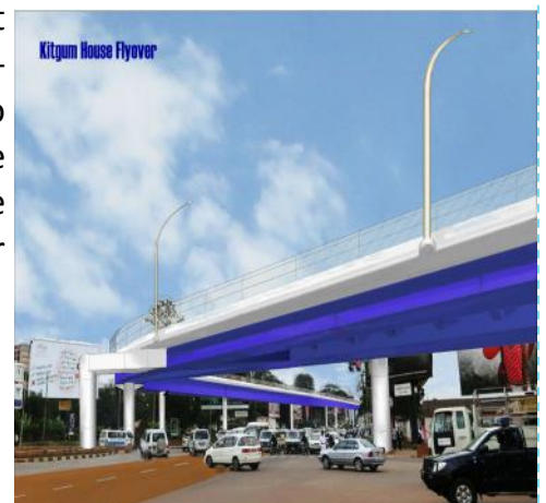
Kitgum House flyover

It is projected that this first phase of the project spanning along Queen's Way to Nsambya Junction above the clock tower will be completed by December 2021.